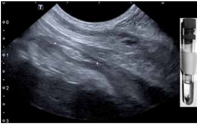
Figure 1. Grass awn in the vagina of a dog. A hyper-echoic, spindle-shaped structure (between cursors) with multiple parallel bright interfaces is observed in longitudinal plane in the vagina. Its length is approximately 15 mm. Distal acoustic shadowing is absent.

abdominal window. The extremity of the forceps was moved as close as possible to the caudal extremity of the grass awn. Then, the forceps was opened, shortly moved cranially, slightly rotated along its long axis to ensure to be on either side of the foreign body, and was then closed and removed. After the procedure, in both cases, some gas bubbles were visualized in the lumen of the vagina due to the entrance of the forceps. The grass awns and the vagina were carefully inspected to confirm that the foreign body had been entirely removed. In both cases, the grass awns were adherent to the vaginal wall. This mural adhesion influenced the traction strength necessary to carry on the forceps to retrieve the foreign body. In case 2, a piece of vaginal mucosa was removed with the grass awn without consequence for the cat.