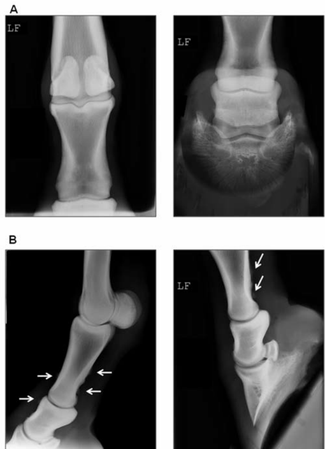
Figure 1. Dorsopalmar (A) and lateromedial (B) radiographic images of the pastern joint. The images on the left are weight-bearing and on the right using the podblock. The white arrows indicate the periarticular new bone formation.

For the first intra-articular injection, 2.5 \times 10^6 autologous PB-derived MSC of passage 1 (P 1 ) were resuspended in 2.5 mL of sterile PBS with 50 µg/mL gentamicin (Sigma-Aldrich, Bornem, Antwerp, Belgium) and injected into the pastern joint of the patient. A si-