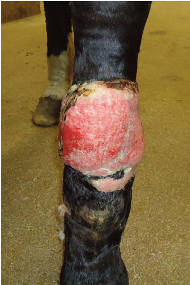
Figure 1. Appearance of the wound on the dorsomedial and dorsolateral aspects of the left metatarsus at the time of admission. Note the pale and irregular appearance of the exuberant granulation tissue.