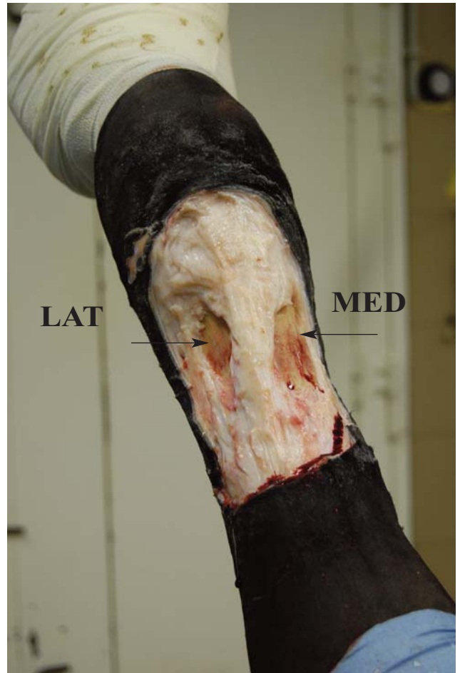
Figure 3. Intraoperative picture after all of the exuberant granulation tissue has been excised, the wound edges have been refreshed and the periosteal exostoses have been removed. There are two areas of exposed bone (arrows) – at the dorsolateral and the dorsomedial aspects of the wound.