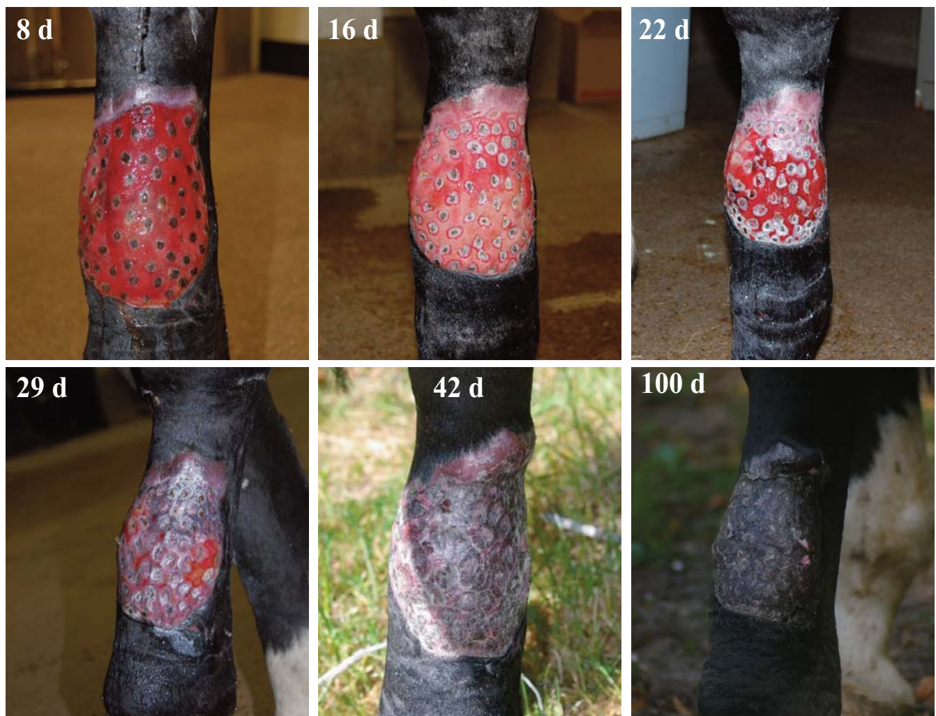
Figure 8. Progression of wound epithelialization after discontinuation of the vacuum therapy (d = days post skin grafting).