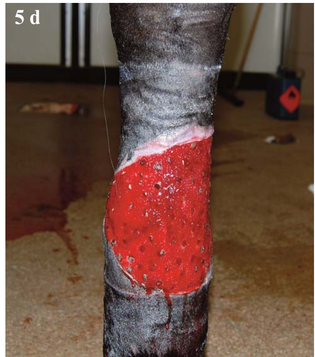
Figure 7. Appearance of the wound bed at the time VAC therapy was discontinued (d = days post skin grafting).

At bandage removal, a graft acceptance of nearly 100% was observed, with granulation tissue of good quality. Hypergranulation did not occur, but the surface of the granulation tissue was irregular, most likely due to suction of the tissue onto the foam (Figure 7). The wound was no longer excessively exuding. A remarkable decrease in the limb edema was also observed. In order to achieve homogeneous granulation tissue, an ointment containing antibiotics and corticosteroids (Fucidin® hydrocortisone, 20 mg/g fucidinic acid and 10 mg/g hydrocortisone acetate) was applied topically and the bandage was replaced for two days. During the epithelialization phase, the limb was continuously kept under bandage with hydrophylic polyurethane foam (Kendall™) as the primary wound dressing. The bandages were changed every four to six days during this period. After the VAC therapy, the granulation tissue remained of good quality and the grafts gradually epithelialized to coalesce with each other and with the wound edges (Figure 8). Recurrent localized swelling of the granulation tissue between the grafts preventing epithelialization was observed at the distal and medial aspects of the limb and was treated