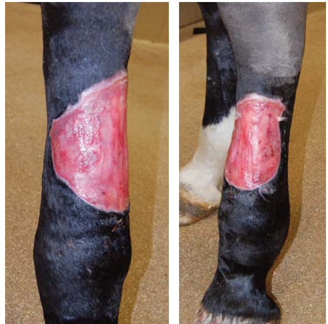
Figure 5. After 28 days (including an 11-day preparation period (with daily bandage changes with local application of fucidinic acid and silver sulfadiazine on alternating days), the granulation bed is now ready for skin transplantation.

VAC therapy was continued for five days without bandage change during that period. Five days after the