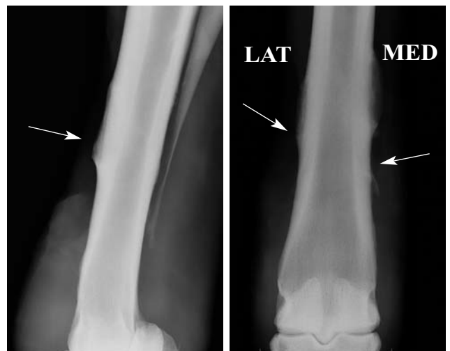
Figure 4. Postoperative lateromedial (left) and dorsoplantar (right) radiographs of the left metatarsus show that periosteal exostoses have been removed (arrows).