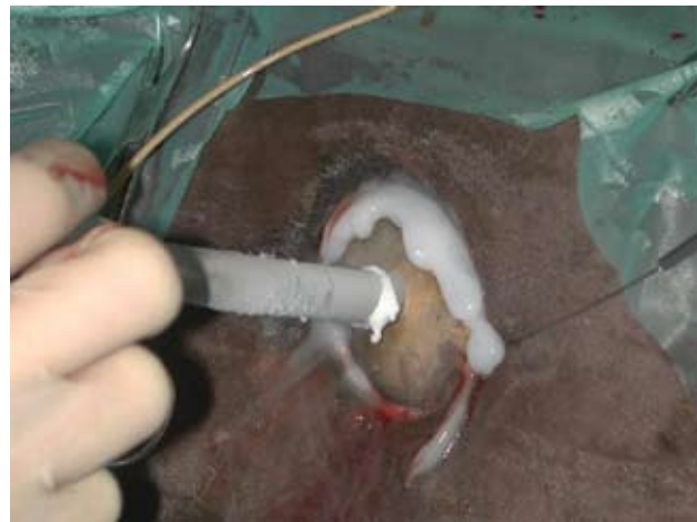
Figure 2. Continuous circulation contact probes for cryosurgery of debulked sarcoid lesions. Tissue temperature is monitored carefully with thermocouple needles inserted into the tumor mass.

Surgical excision of equine sarcoids has been applied for decades with variable success. High recurrence rates of 40 to 72 % are reported (Ragland, 1970; Diehl et al. , 1987; Mcconaghy et al. , 1994; Brostrom, 1995). This can be attributed to the infiltrative nature of the tumor and auto-transplantation of tumor cells during the surgical procedure (Klein, 1990; Howart, 1990). On histology, fronds of tumor cells infiltrating the surrounding dermis and sometimes the underlying tissues can be observed (Ragland, 1970; Tarwid et al. , 1985). The detection of BPV DNA at the surgical margin of an excised sarcoid correlates with an increased risk of recurrence (Martens et al. , 2001a). When the excision is performed with wide normal skin margins (at least 12 mm; Figure 1) and a non-touch approach (i.e. changing of gloves and material after tumor removal and extensive flushing of the wound), auto-inoculation with tumor cells and viral material can be avoided and success rates of more than 80 % are achieved (Howart, 1990; Brostrom, 1995; Martens et al. , 2001b). Another major factor in the prognosis is the possibility to perform the excision under general anesthesia (80 % success) compared to