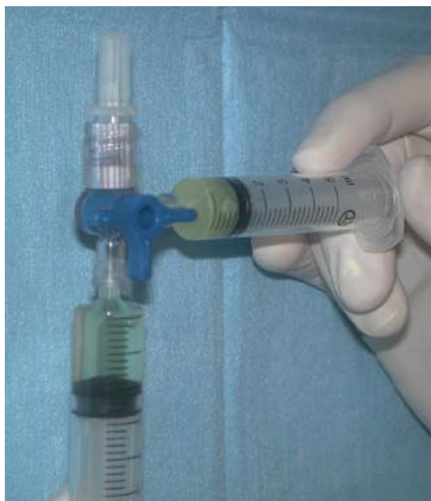
Figure 3. Preparation of cisplatin emulsion by mixing of an aqueous cisplatin solution and sesame oil through a 3-way valve.

they crust develops within a few days, and sloughs gradually over several weeks eventually leading to an open wound which heals by second intention.