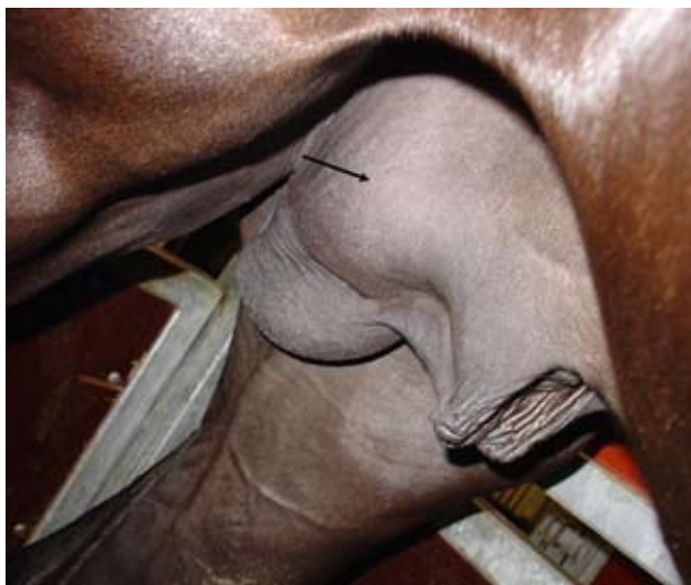
Figure 2. The scrotum had an asymmetrical appearance due to retraction of the painful right testicle (arrow).

removal of the affected testis. In a very early stage it is possible to resolve the torsion and then attach the testicle in the scrotum (Schumacher and Varner, 1997; Knottenbelt, 2003).