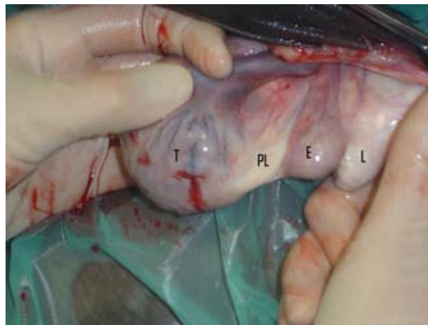
Figure 1. Anatomy of the normal testis and epididymis. 1) proper ligament (PL) of the testis (T), 2) ligament (L) of the tail of the epididymis (E).

but can be excluded by palpation of the scrotal contents, examination of the vaginal rings per rectum and by the use of ultrasonography (U.S.). The treatment of torsion of 360° or more usually consists of