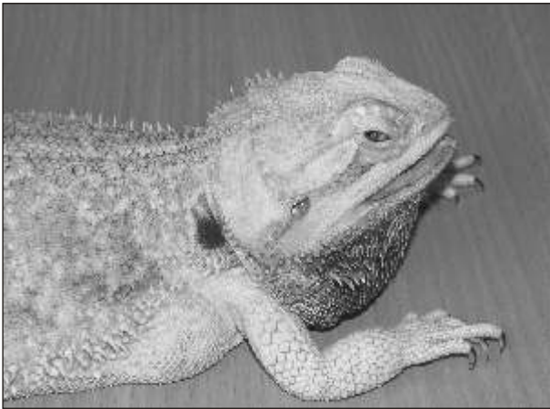
Figure 1. Inspiratory dyspnea and peri-orbital edema.