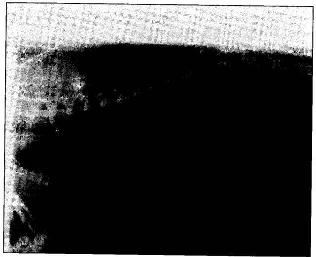
Fig. 2. A lateral radiograph of the thorax demonstrating a diffuse interstitial and peribronchial pattern.

A radiograph of the thorax was taken and showed pulmonary pathology (see Fig 2). Nasal radiography was not performed. No signs of eye or central nervous system involvement were present.