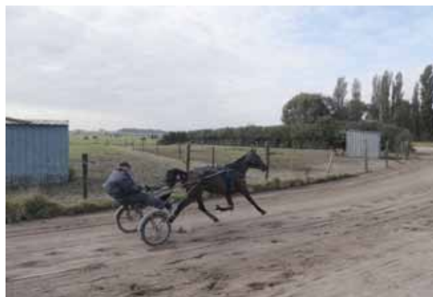
Figure 4. Harness trotting during training.

The racing performance of thoroughbred racehorses depends on both their aerobic and anaerobic capacities. Additionally, thoroughbreds have higher V200 values than other breeds (Vermeulen et al., 2006; Wolter et al., 1996). During incremental exercise tests, a reproducible HR-speed relationship may be determined (Munsters et al., 2014). The derived indices of exercise capacity, like V200, VLa4, VHRmax and Vmax, provide a view on exercise capacity (Vermeulen et al., 2006; Kobayashi et al., 1999). VO2max and VHRmax are correlated with the racing performance in thoroughbreds (Harkins et al., 1993; Wolter et al., 1996). Incremental SETs are less suitable for thoroughbred horses, because of the difficulty to make them run at constant speeds and to control track conditions (Courouce et al., 2013). Therefore, a single-bout exercise test seems more suitable to assess performance capacity in thoroughbreds. Single-step exercise tests that take into account the variability