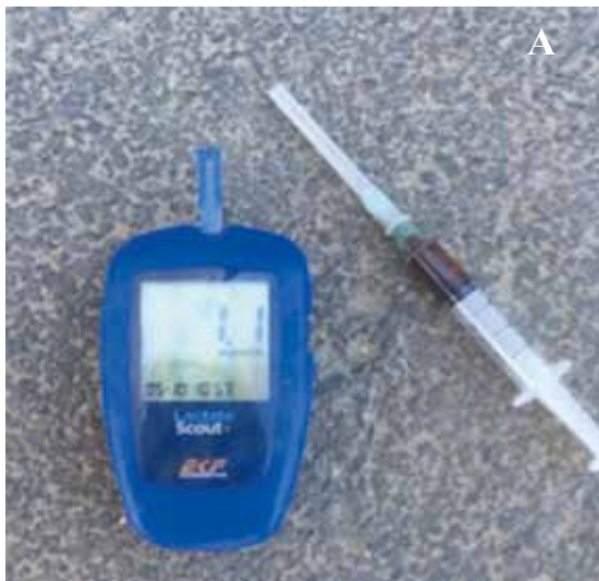
Figure 3A. Handheld lactic acid measuring device. 3B. The relation between HR (blue curve) and lactic acid concentration in blood (green line) during increasing speeds (X-axis).