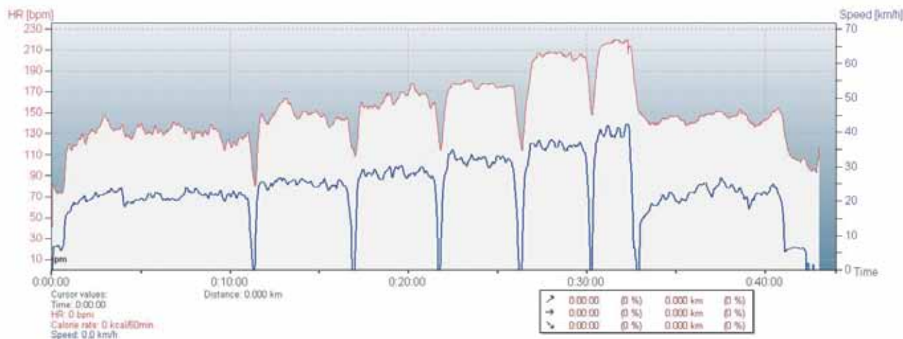
Figure 2. HR (red) and velocity (blue) during incremental SET. Each episode represents an exercise bout (interval).

to detect small but significant changes in performance capacity throughout time (Franklin et al., 2014; Allen et al., 2016).