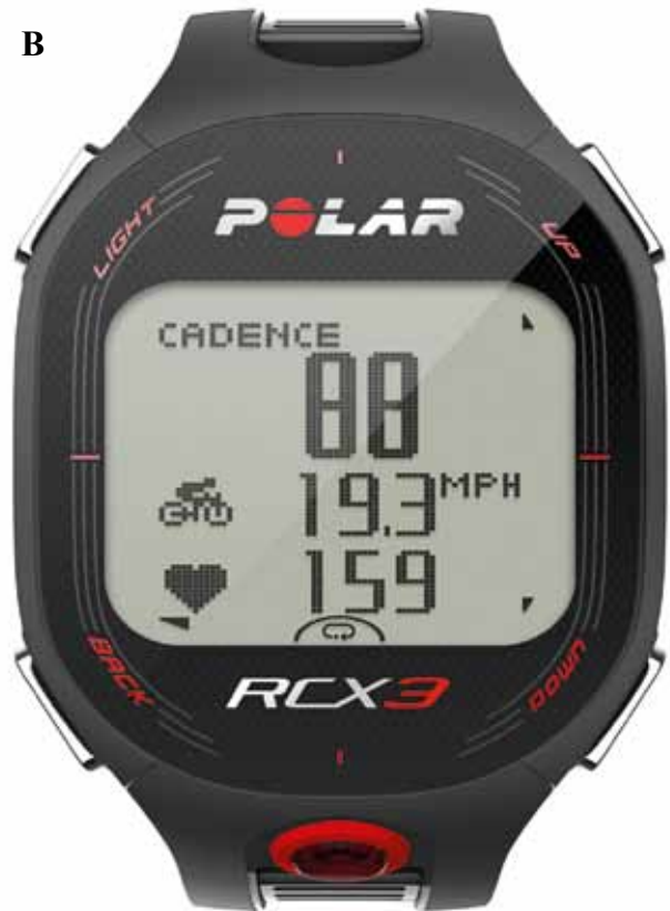
Figures 1A and 1B. GPS equipped heart rate monitors (the two sensors are indicated with the arrows). (Left panel) and GPS equipped watch that depicts heart rate and velocity in the horses throughout exercise.

a show jumper. Besides performance capacity, there is also the factor skills. Show jumping and dressage require the horse to be able to demonstrate a certain set of skills in order to perform optimal competition. When it comes to measuring physiological parameters throughout equine SETs, both HR and velocity monitoring are very feasible. Longitudinal follow-up of blood lactic acid levels throughout a SET is also quite feasible, since hand-held lactic acid analyzers are available for horses. However, when it comes to measuring maximal power output, it is impossible to put a horse on a Wattbike. In addition, measuring VO_2\max is quite challenging: many efforts have been made by several research groups to achieve this; however, measuring VO_2\max in horses under field conditions retrieves lower maximum values than under laboratory conditions (Van Erck et al., 2007). In all these equine studies, human VO_2\max analyzers were used, which have been adapted for the use in horses. However, keeping in mind that a human athlete in full action displaces approximately 60L of air per minute versus a 500-kg horse approximately 1500L per minute, most probably renders sampling methods and frequencies applied in human analyzers, unsuitable and simply ineffective in horses (Figures 1A and 1B). However, more research is needed with that respect.