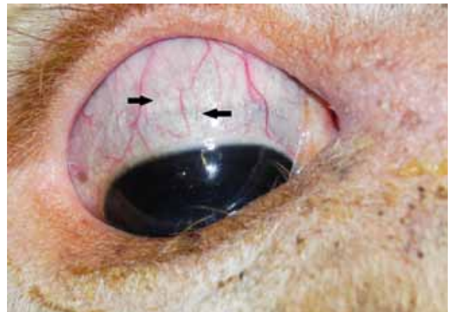
Figure 4. Detail of the pathognomic tissue cysts (black arrows) in the scleral conjunctiva of a six-year-old Blonde d'Aquitaine bull with bovine besnoitiosis.