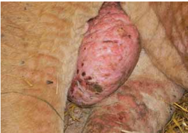
Figure 3. Detail of the thickening and wrinkling with patchy alopecia of the skin of the scrotum of a six-year-old Blonde d'Aquitaine bull with bovine besnoitiosis.