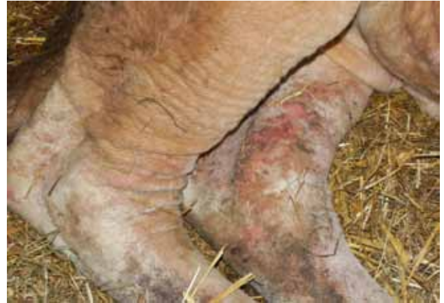
Figure 2. Detail of the thickening and wrinkling with patchy alopecia of the skin of the tarsal region of the hind limbs of a six-year-old Blonde d'Aquitaine bull with bovine besnoitiosis.