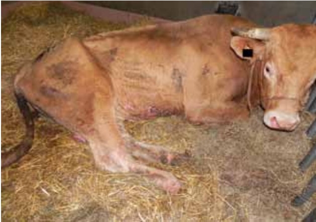
Figure 1. Thickening and wrinkling of the skin of the ventral abdomen and distal limbs of a six-year-old Blonde d'Aquitaine bull with bovine besnoitiosis in poor body condition.