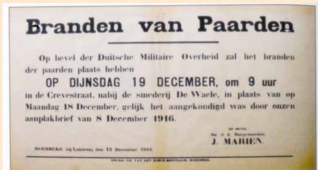
VII-68 Foto: Paarden branden in de Crevestraat bij hoefsmid De Waele.